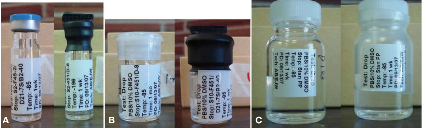
Figure 1. Vial configurations for (A) non-wrapped (left) and wrapped (right) 0.5mL, (B) non-wrapped (left) and wrapped (right) 5.0mL, and (C) non-wrapped (left) and wrapped (right) 30mL (Note: the 30mL overwrap was translucent while the overwrap for the smaller vials was opaque.)

To gain an estimate of thermal transfer characteristics of CZ, time until thaw was measured for each vial type. For this, time was recorded from the point at which the frozen vials were first placed into a 37°C water bath until the last ice just melted.