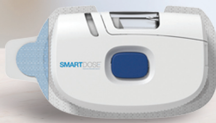
User loaded 3.5 - 10mL