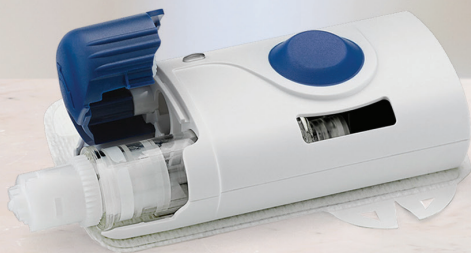
User loaded up to 3.5mL