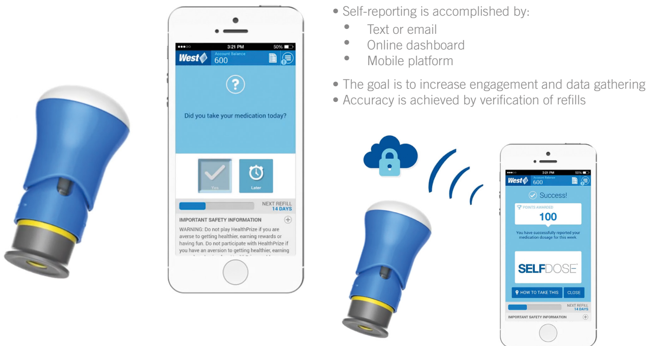
Figure 2: Self-reporting with the West–HealthPrize adherence program

The next iteration is the patient barcode scan that reinforces the validity of the self-reported data, providing further evidence that the drug has been taken and the delivery system used (Figure 3). It also provides supplementary information such as feedback to doctors when the patient begins the program.