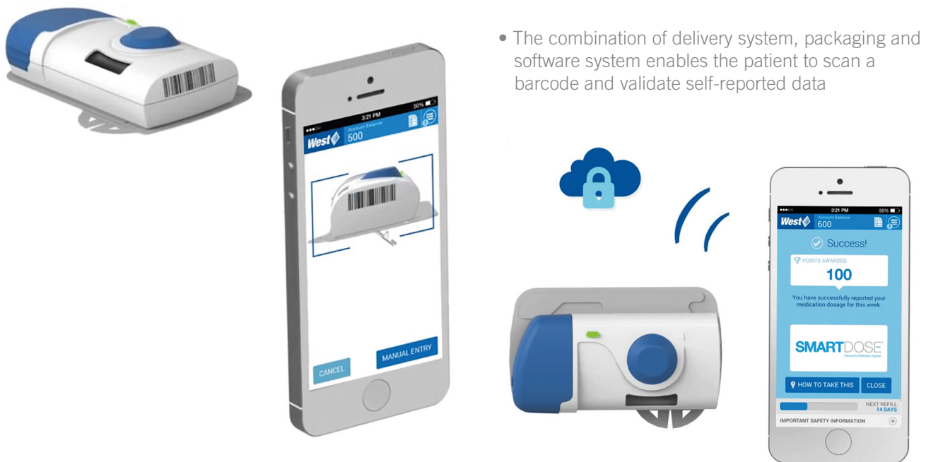
Figure 3: Connecting to West–HealthPrize adherence program through a barcode

Datasets or dashboards allow drug manufacturers to track and analyze the activity and engagement of patients who opt into the adherence program. How often patients read the educational material or the level of engagement they have with other aspects of the program provide valuable information that can inform decisions regarding product improvements or the patient experience. This approach provides higher quality, more reliable information than relying on the current ‘push’ techniques of direct-to-consumer advertising or mainstream marketing.